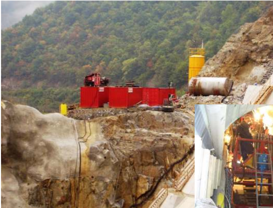
RODIO mixing and Grouting installations on dam abutment