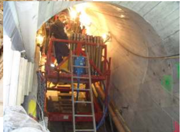
Drill rig inside the Pilot tunnel